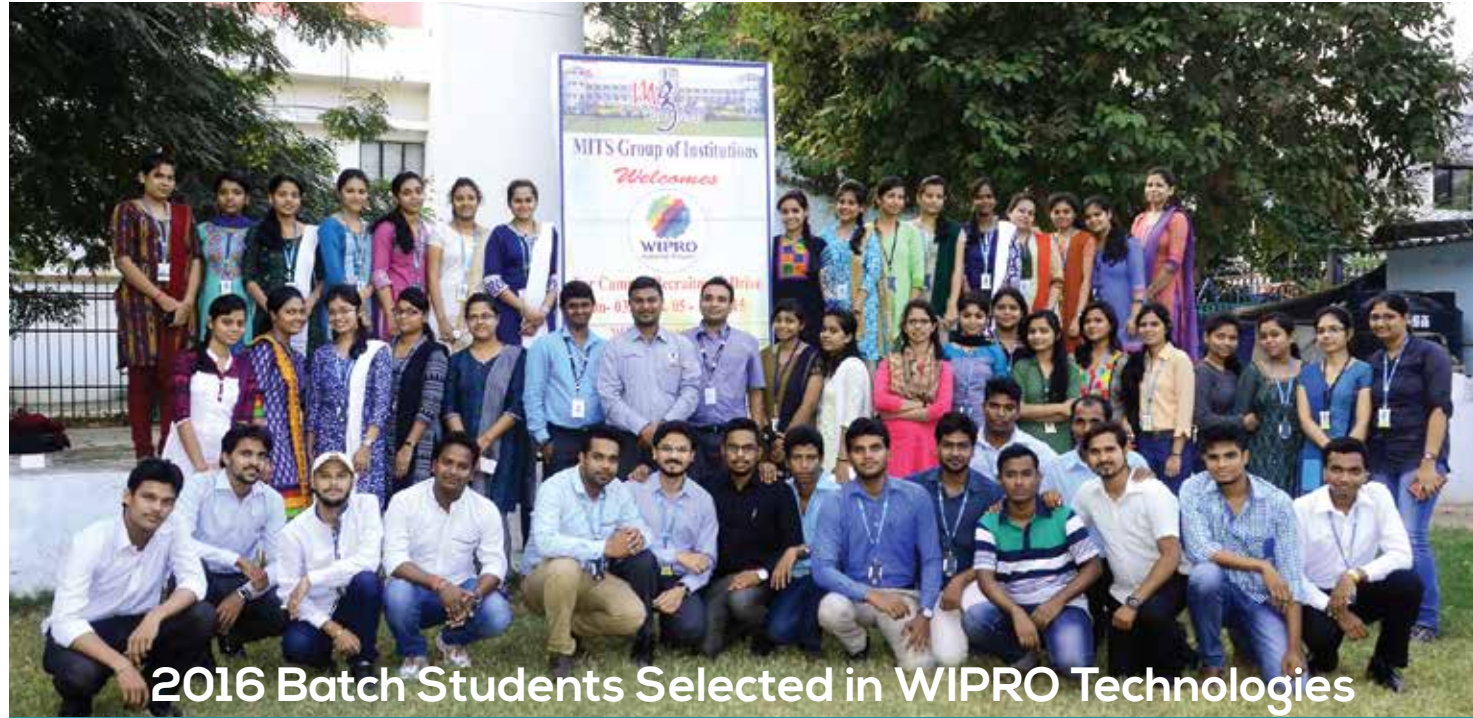
2016 Batch Students Selected in Wipro Technologies