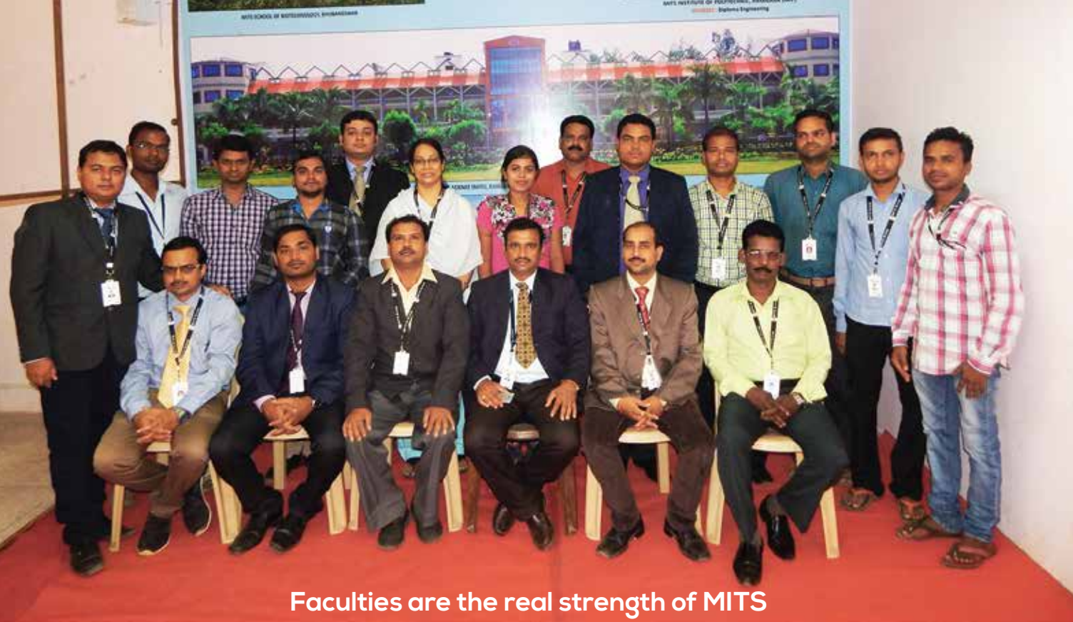
Faculties are the real strength of MITS